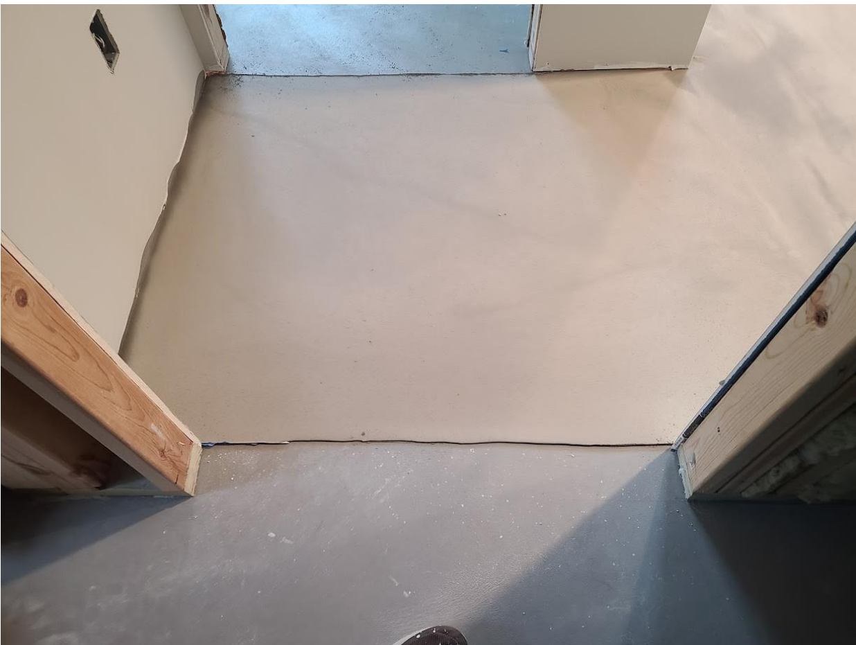
Hallway leveler lips